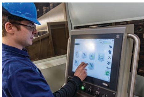
Next generation software processing takes us from drawing to finished part in just a few taps