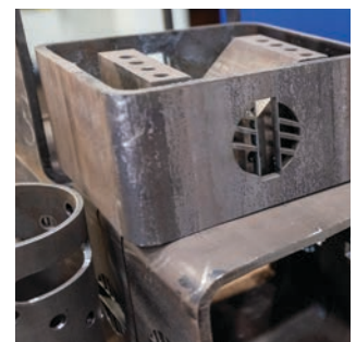
Capable of cutting simple holes to intricate patterns and designs