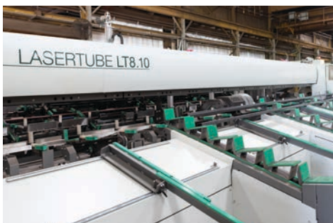
Step-by-step autoloader for increased speed and productivity