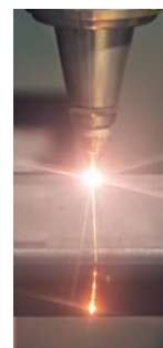
Precise cuts to your specs