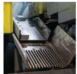
Automatic, hydraulic discharge chute sorts finished pieces