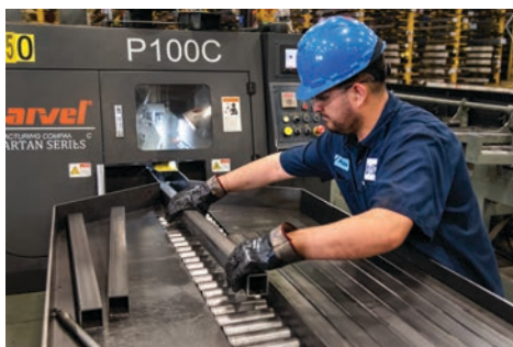
Continuous feeding of bar and tube stock possible with automated loading table