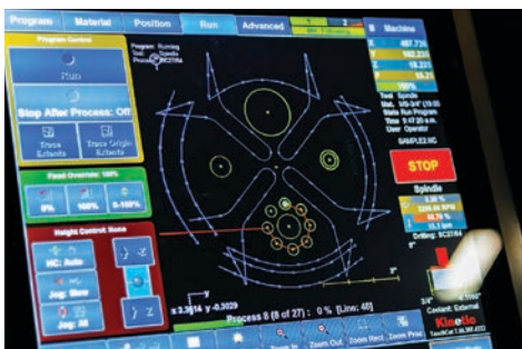
19" LCD touch-screen to accurately monitor multi-step, multi-tool processing for your job