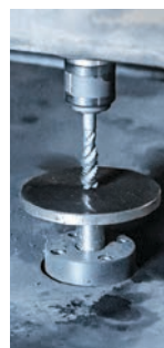
Fast, accurate calibration for less downtime than manual processing