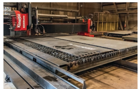
Expansive 16' x 40' cutting table allows small parts to be processed side-by-side, or large orders to be cut within full plate size